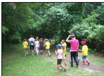
Venturing out onto the trails to explore the great outdoors