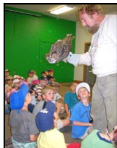
Face-to-face with a Great-Horned Owl