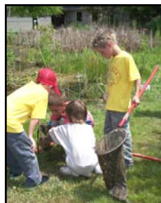
Catching and releasing aquatic