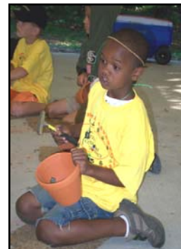
Crafting Wren houses out of clay pots