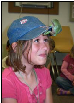
Getting up-close and personal with a tree frog