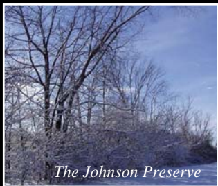
The Johnson Preserve